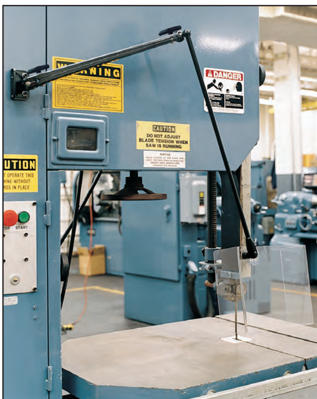
Universal ball & socket shield shown on a band saw.