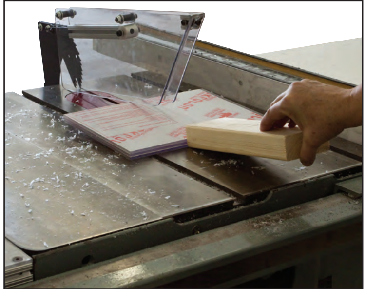
Table saw shield in operation with push stick.

OSHA 1910.213 (a)(10) also recommends that each power-driven woodworking machine be provided with a disconnect switch that can be locked in the off position. See pages 63-69 for disconnect choices.