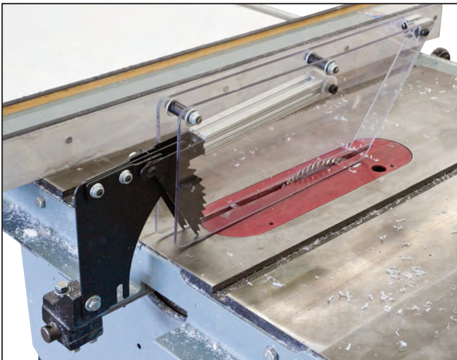
Table saw shield assembly.