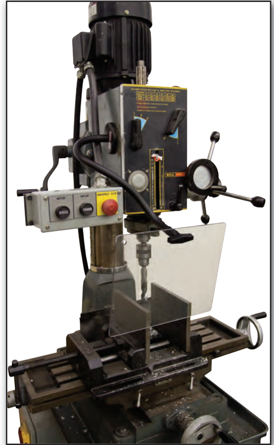
Flexible spring-steel arm shield on milling machine.

The flexible-arm shields have two mounting options: direct or magnetic. The direct-mount base can be fastened directly to a machine with two \frac{1}{4} " fasteners (included). The magnetic base consists of a 3"-diameter magnet with 100-lb holding force . If an adequate flat, ferrous mounting surface is not available, an optional steel mounting plate can be permanently attached to the machine to hold the magnetic base.