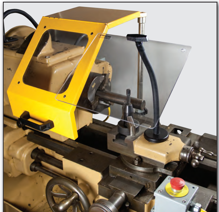
Flexible spring-steel arm shield on lathe.