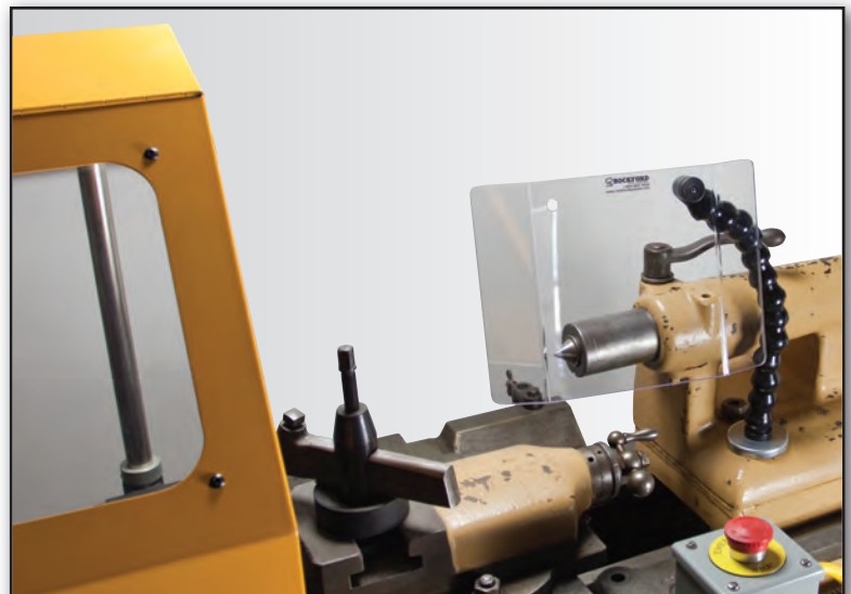
Flexible copolymer lock-arm shield on lathe.