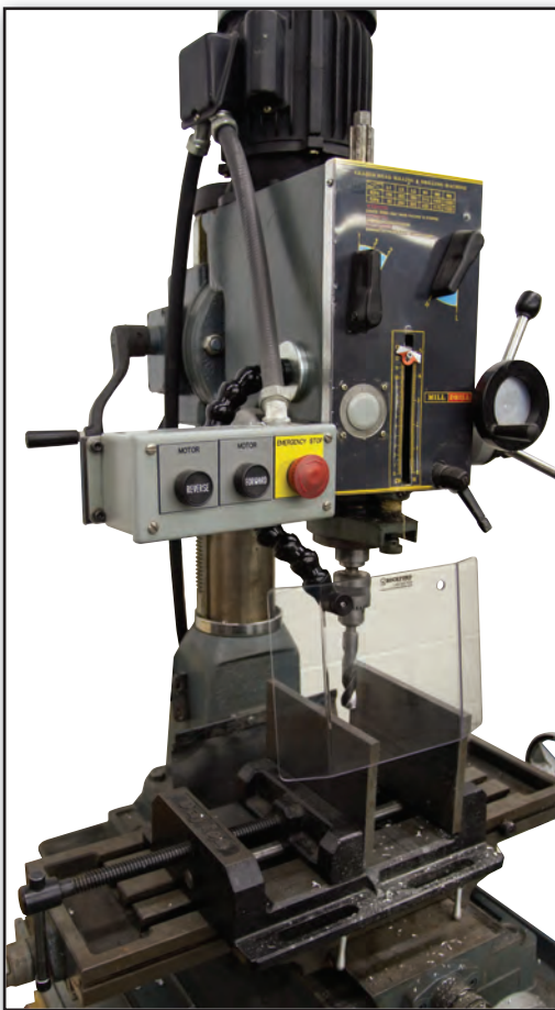
Flexible copolymer lock-arm shield on milling machine.