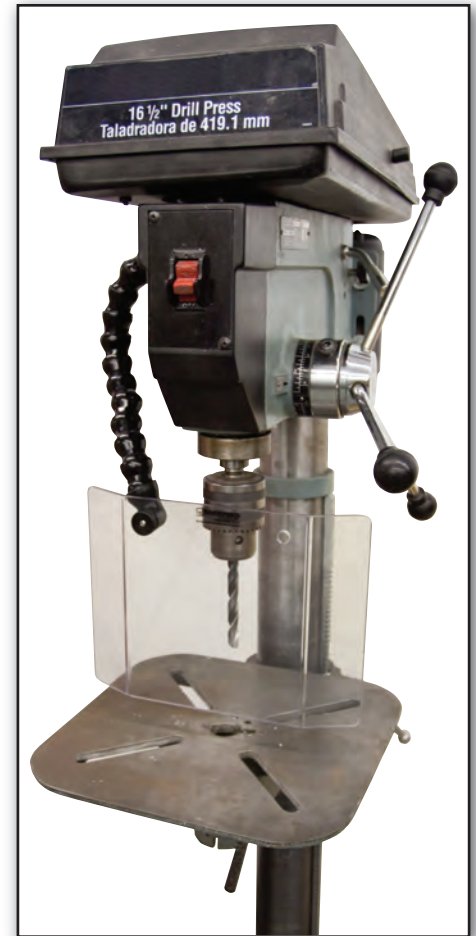
Flexible copolymer lock-arm shield on drill press.

The flexible lock-arm shields have two mounting options: direct or magnetic. The direct-mount base can be attached directly to a machine with the furnished \frac{1}{4} -20 button-head cap screw. The magnetic base can be attached to any ferrous surface on the machine with the 3"-diameter, 80-lb pull magnet . If an adequate flat, ferrous mounting surface is not available, an optional steel mounting plate is available that can be permanently attached to the machine to hold the magnetic base.