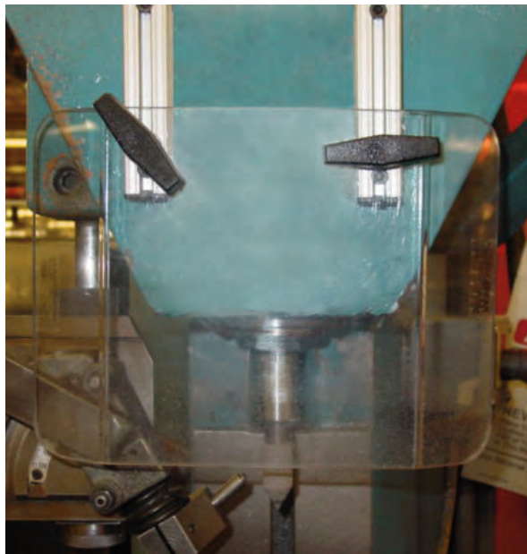
Adjustable slide shield on front column of machine.

These shields can be mounted vertically or horizontally on the flat surface of any machine. The transparent portion of the shield attaches to the mounting brackets and offers a slide adjustment of 3\frac{1}{2} ". Two standard size shields with 30^\circ sides are available: 7\frac{3}{4} " x 11" and 9\frac{1}{2} " x 19". Contact us for other shield sizes or longer adjustments.